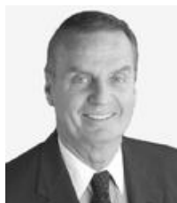
GENERAL JAMES L. JONES Director Nominee

Other Directorships and Memberships: Chairman, Mountainside Hospital, Merit Health Systems, Inc.