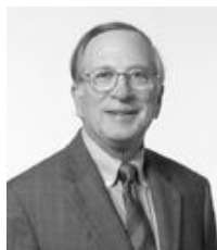
SENATOR SAM NUNN Director since 1997

Other Directorships and Memberships: Director, Cross Match Technologies; Chairman, Atlantic Council of the United States; Center for Strategic and International Studies Board of Trustees; Chairman, Armed Forces Benefits Association; Chairman, Marine Corps Heritage Foundation.