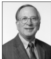
SENATOR SAM NUNN Director since 1997

Other Directorships and Memberships: Mountainside Hospital Merit Health Systems, Inc.