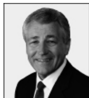
CHUCK HAGEL Director Nominee