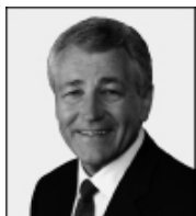
CHUCK HAGEL Director Nominee